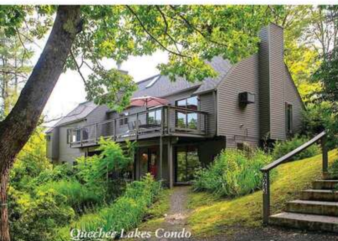
Quechee Lakes Condo

Mountain homes here are pricy to say the least, starting at about $650,000 and condominiums from $350,000. Attitash Grand Summit Hotel / Resort allows 13-week fractional ownership of luxury hotel suites in a beautiful resort hotel / resort complex, adjacent to Bear Peak at Attitash Mountain