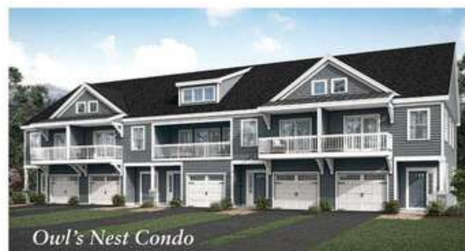
Owl's Nest Condo