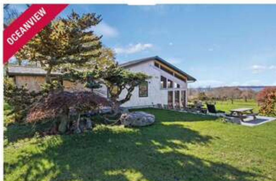
Little Compton, RI Studio on Private Estate