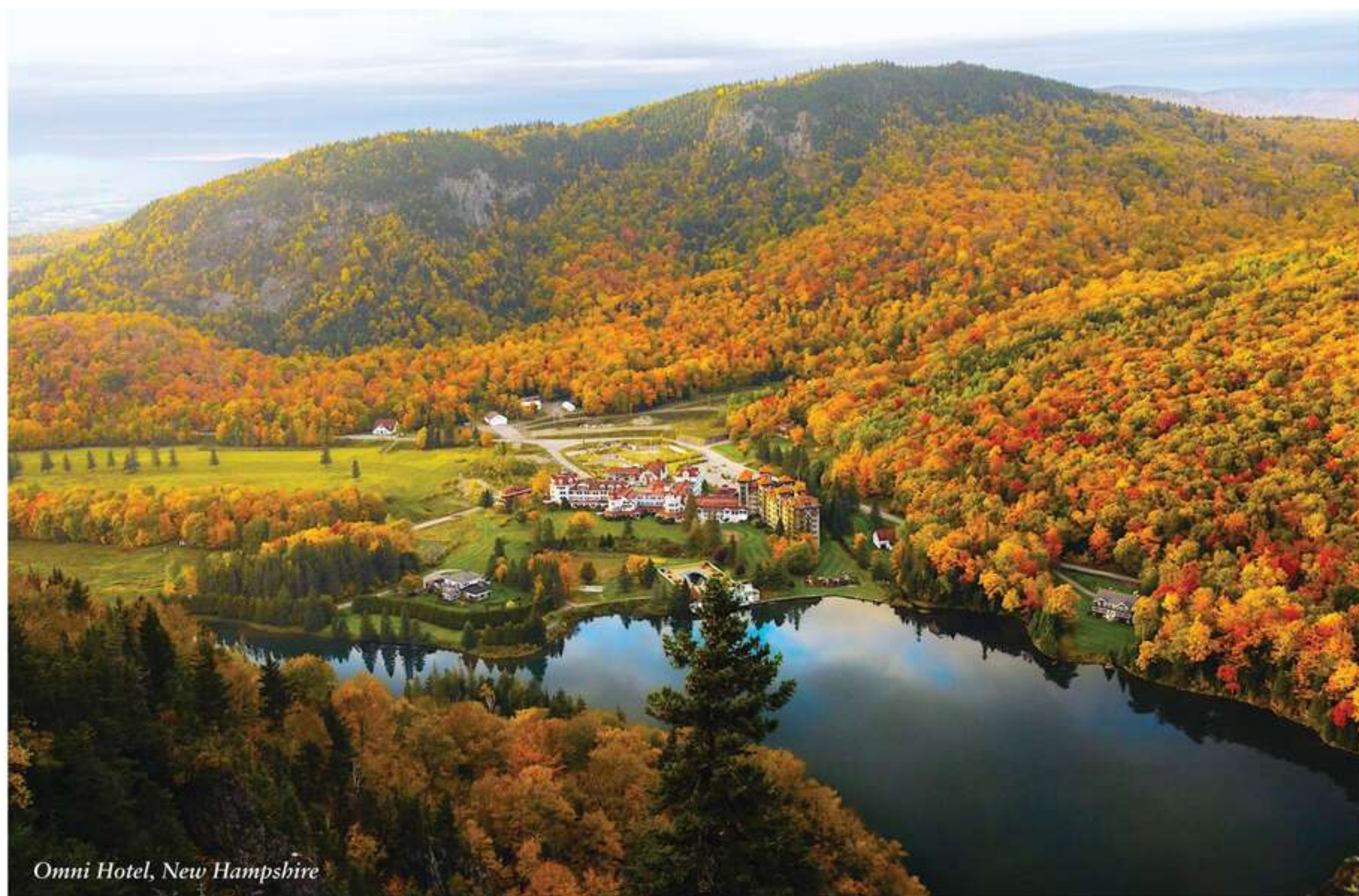
Omni Hotel, New Hampshire