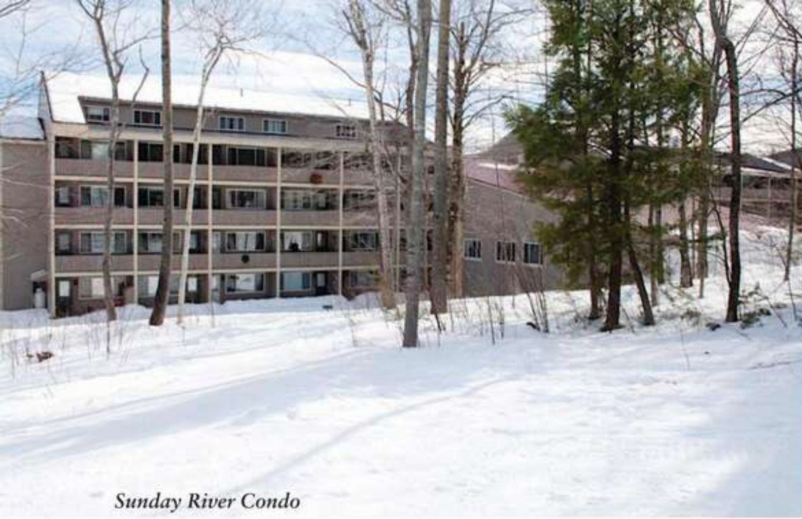
Sunday River Condo

with expansive year-round amenities, for around $150,000.