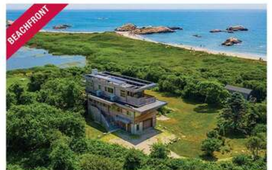
Little Compton, RI 4 Bedroom / 4.5 bath; Private Beach Access

29 Meeting House Lane Little Compton, RI 02837 | WelchmanRealEstate.com