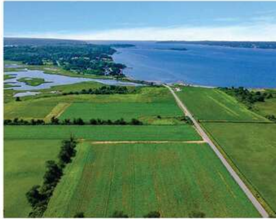
Land - Tiverton, RI Seapowet - 6 acres of pristine farmland $2M