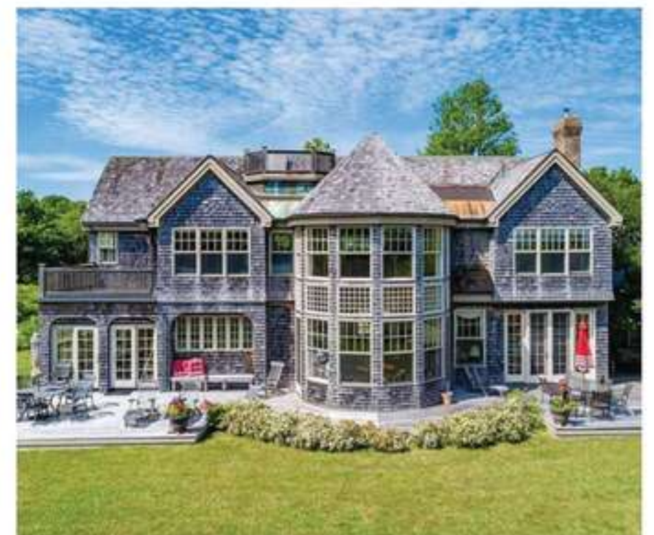
LITTLE COMPTON, RI $5M

401.649.1915 | Renee.Welchman@Compass.com | WelchmanRealEstate.com