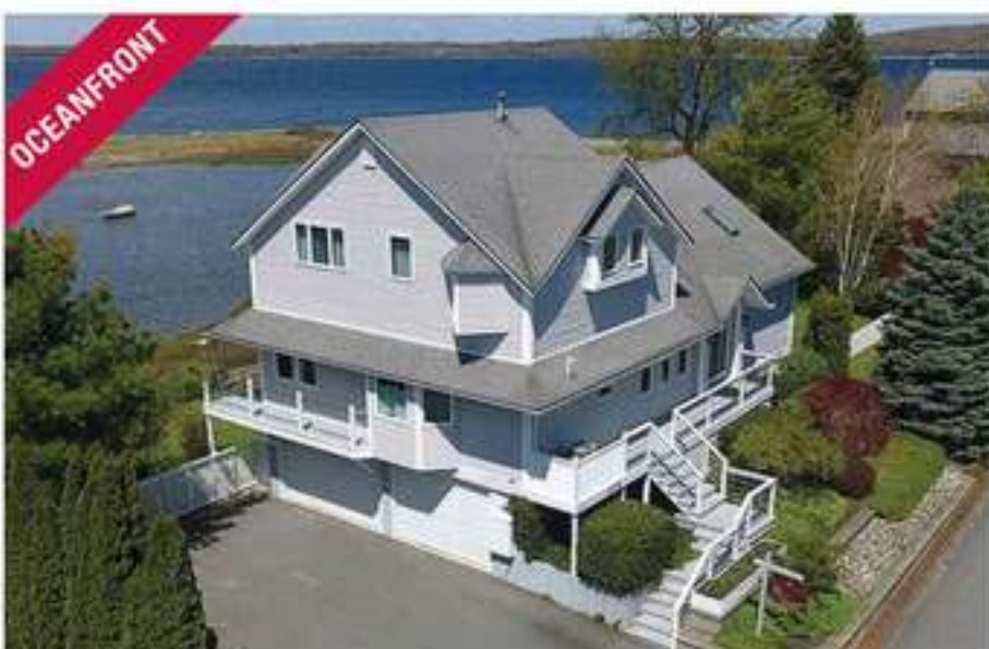
Portsmouth, RI 3 bedroom / 3 bath; Sleeps 8

Call For Weekly Monthly Updates on All Available Rental Homes