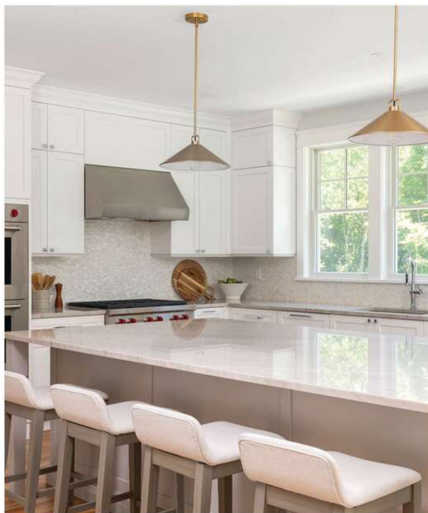
▲ Fully equipped designer kitchen with custom cabinetry and 9'6" island.

Situated just minutes from Mackerel Cove, this classic shingle façade, set on an expansive 3.49 acre lot, blends traditional coastal aesthetics with contemporary amenities, making it a true sanctuary. Inside you are greeted with an open concept floor plan highlighted by an expansive kitchen fully equipped with custom cabinetry, luxury appliances including a Zephyr beverage cooler, and a large 9'6" custom quartzite island. The kitchen effortlessly transitions into the dining area and the spacious living room, which boasts a coffered ceiling, custom built-in shelves, and a striking gas fireplace, designed for entertaining and intimate gatherings. The primary bedroom suite, thoughtfully positioned on the first floor, offers a private retreat with a spacious walk-in closet, double vanities, and luxurious soaking tub. The first floor is also home to essential features such as a mudroom, powder room, and a well-appointed laundry room. Upstairs, the home continues to impress with three additional bedrooms, each with its own full bath, a living room with a charming