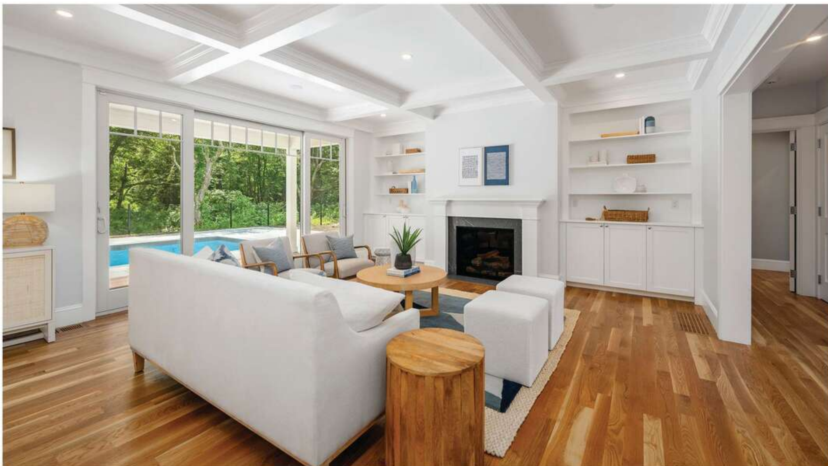
▲ Expansive living room with coffered ceilings and custom built-in shelves.

Nestled in the heart of Jamestown, RI, where the charm of coastal living meets the historic allure of Beavertail and Battery Park, this newly constructed home exemplifies the pinnacle of sophisticated design and modern comfort. This 4 bedroom, 4.5 bath custom home spans 4,000 square feet and offers a seamless blend of classic architectural beauty and luxury, creating a retreat that is both inviting and exceptional.