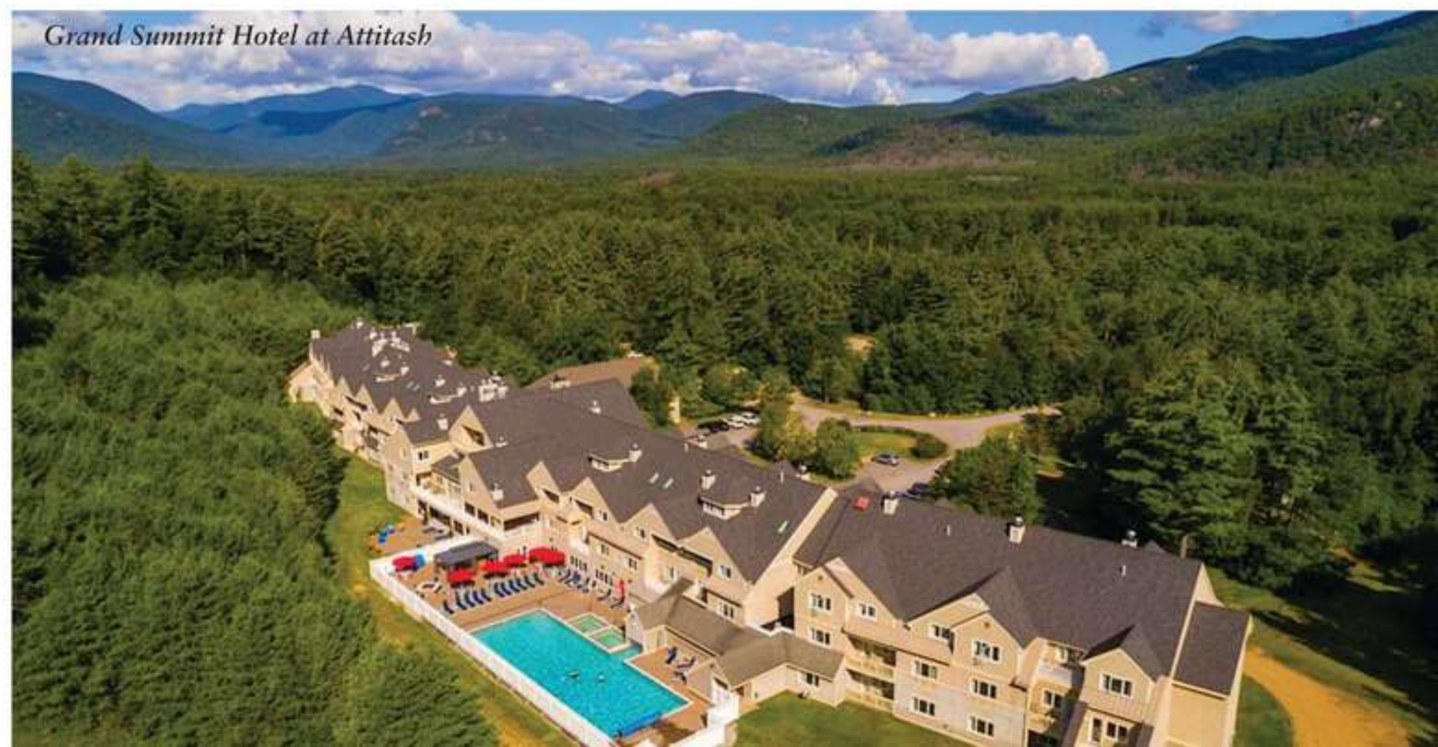
Grand Summit Hotel at Attitash