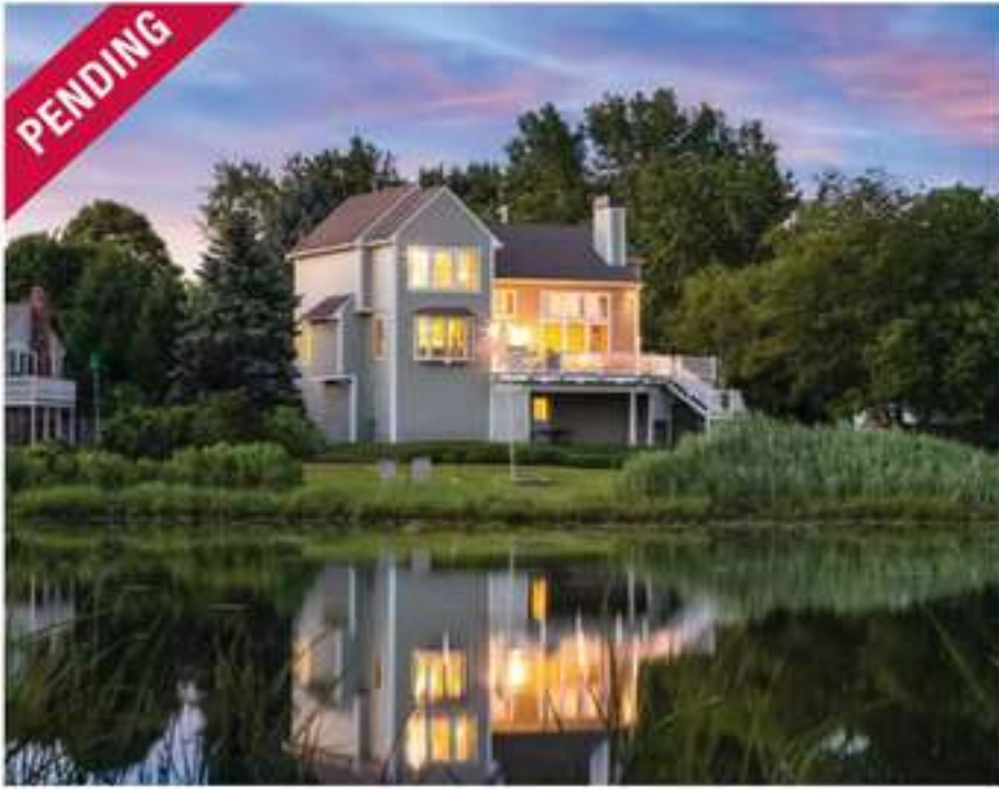
150 Old Mill Road Warwick, RI Custom Built Waterfront Home $849,900