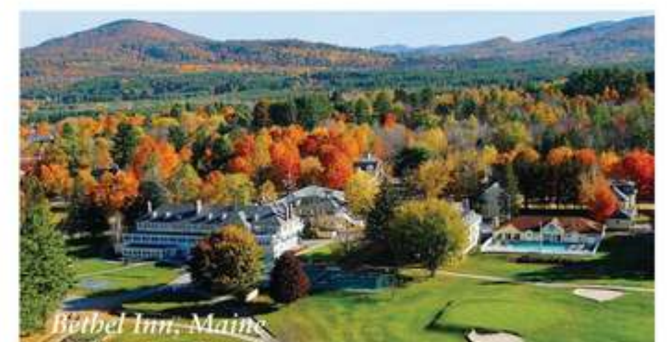
Bethel Inn, Maine