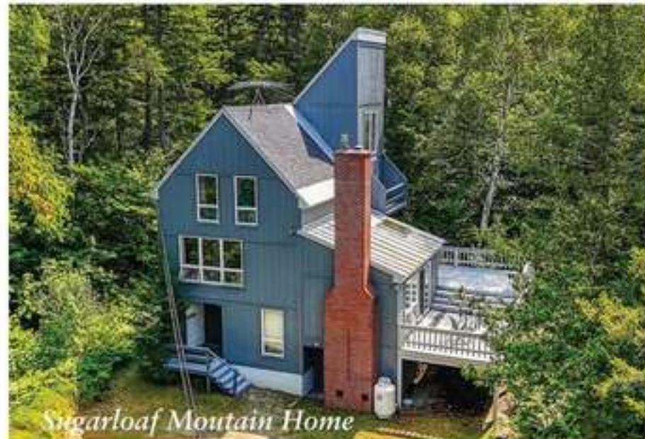
Sugarloaf Mountain Home

Maines largest four-season resort with amazing winter sports, summer activities, Robert Trent Jones Jr designed spectacular golf course. A world class mountain biking resort in the Northeast and home to the Xterra Trail Run World Series. Boyne Resorts has made Sugarloaf one of the finest year- round destinations for outdoor fun. Numerous Winter, Spring, Fall and summer special events and some of New England's best foliage destinations. Full sports and fitness center, pools, adventure center, anti- gravity complex and so much more. The resort offers great dinning choices, shopping, terrain parks & trails. Great opportunities at Dutchman Woods and the New West Mountain development offers new homes and condos. Resort condominiums from $275,000. Mountain Homes from $600,000