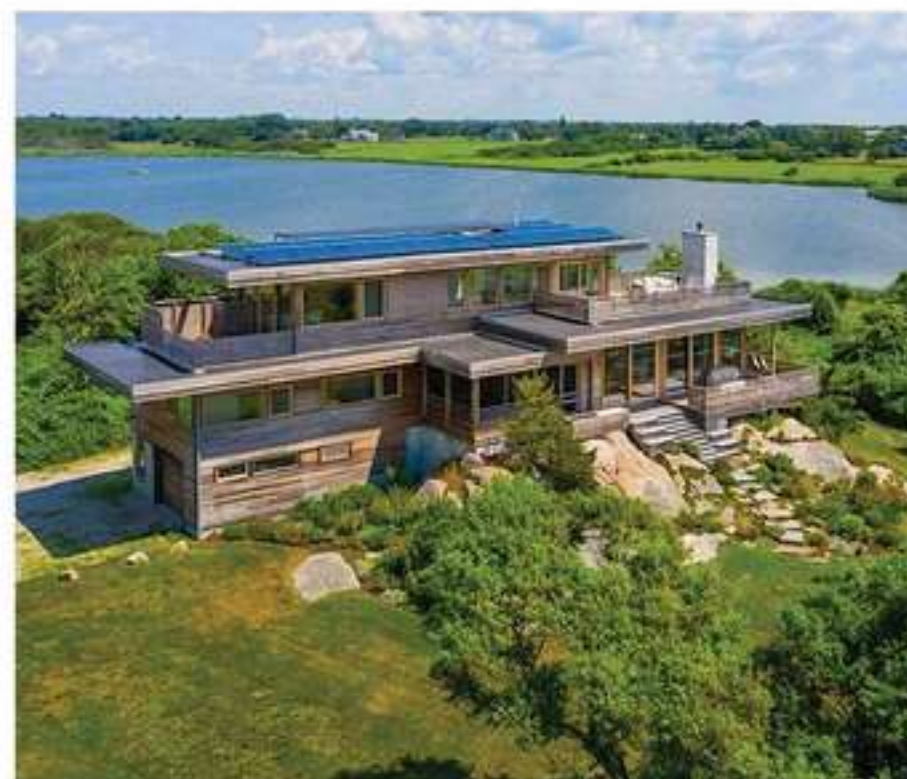
LITTLE COMPTON, RI $4.88M