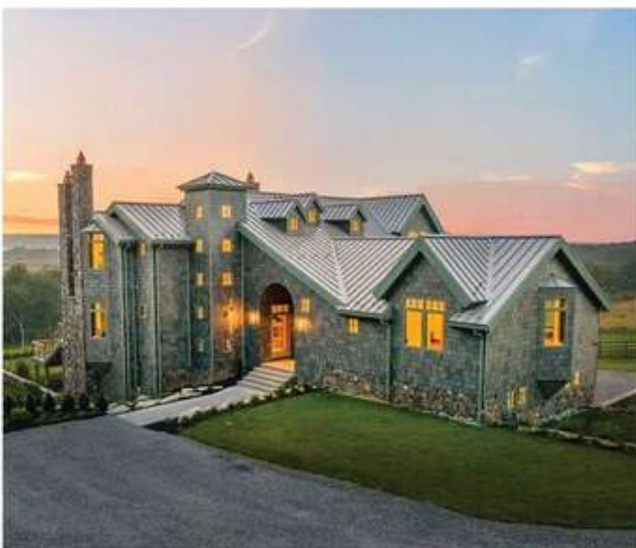
TIVERTON, RI $5.3M