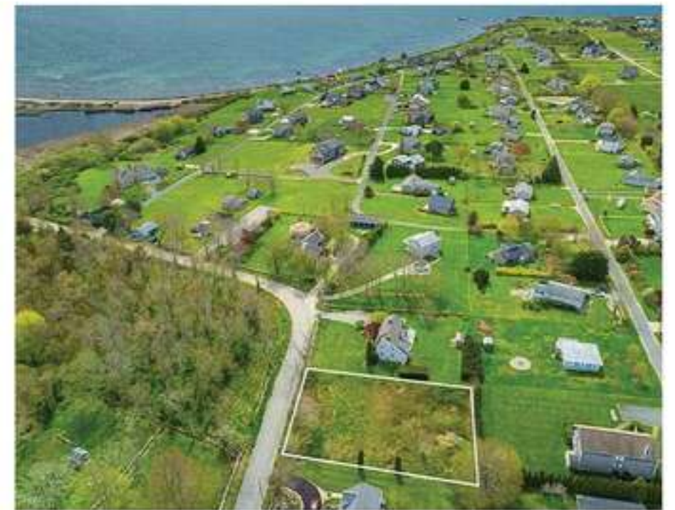
Land - Little Compton, RI South Shore $545,000